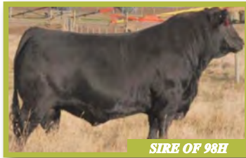
SIRE OF 98H