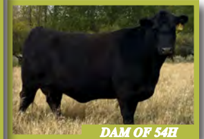
DAM OF 54H