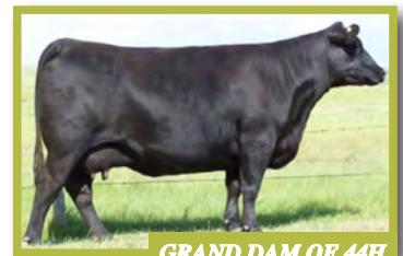
GRAND DAM OF 44H AND 74H