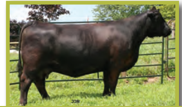
GLEN ISLAY PRIDE 12N. DAM OF GLEN ISLAY WINSTON 14U.

43 BRONYX ERIC 89H 2175639 TOT 89H APRIL 2, 2020