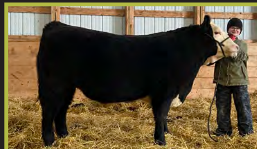
BRILL'S 4-H STEER, 'TEDDY' SIRE BY OUR HOME RAISED SIRE LSB GAMEPLAN 33G