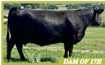
DAM OF 17H

Dam is daughter of Double AA Annie K 578L – A Peak Dot Flush Cow – Strong cow line - This is an extra long bull - Easy to scratch - Herd Bull presence.