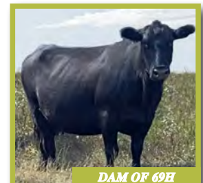
DAM OF 69H