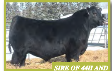
SIRE OF 44H AND 74H