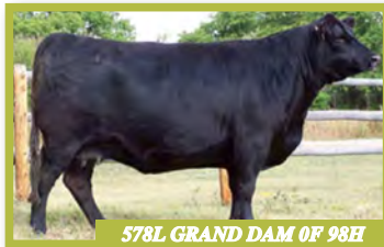
578L GRAND DAM OF 98H